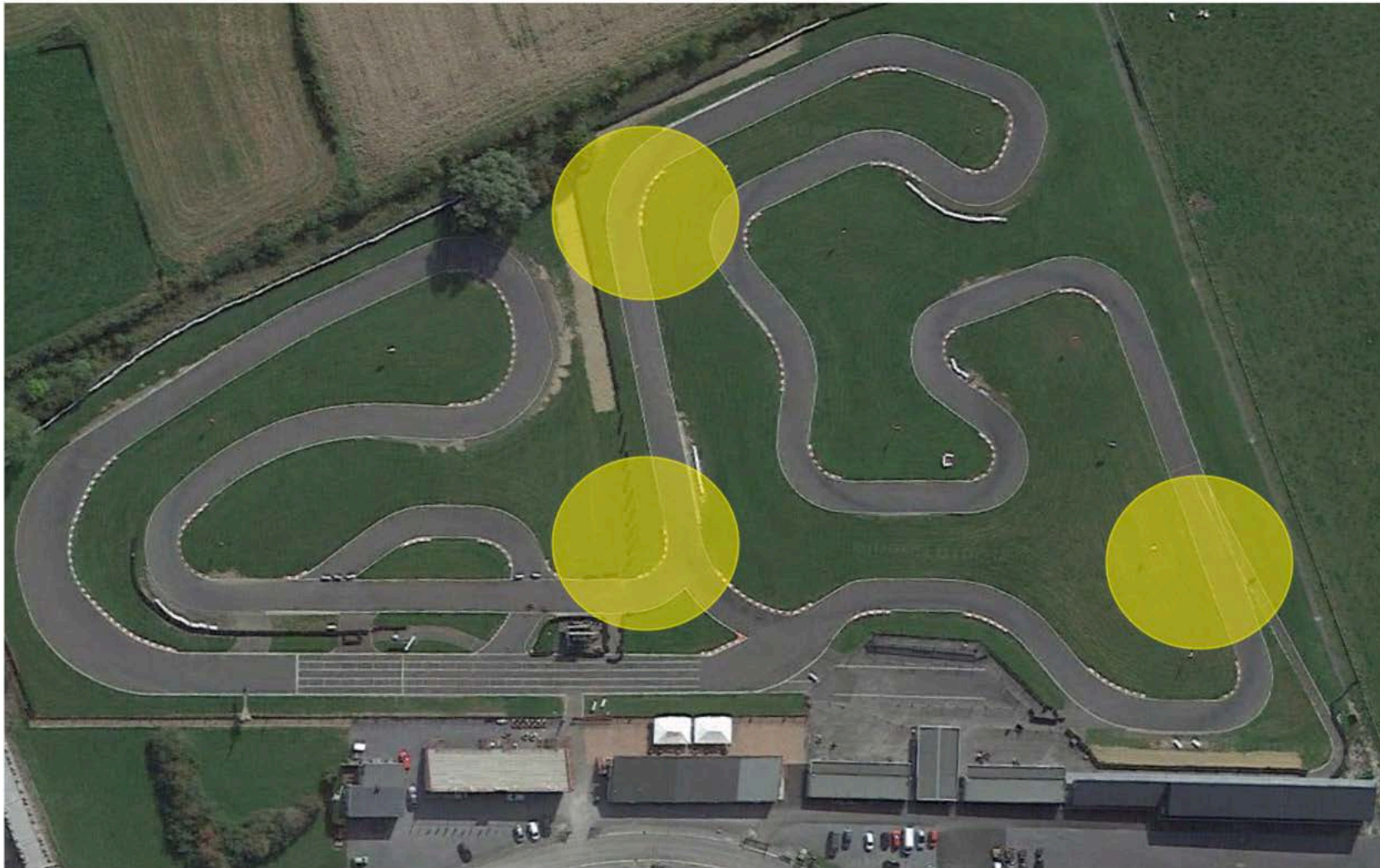
Figure 3: Top view Mariembourg: Pay extra attention and reduce speed in a yellow flag situation