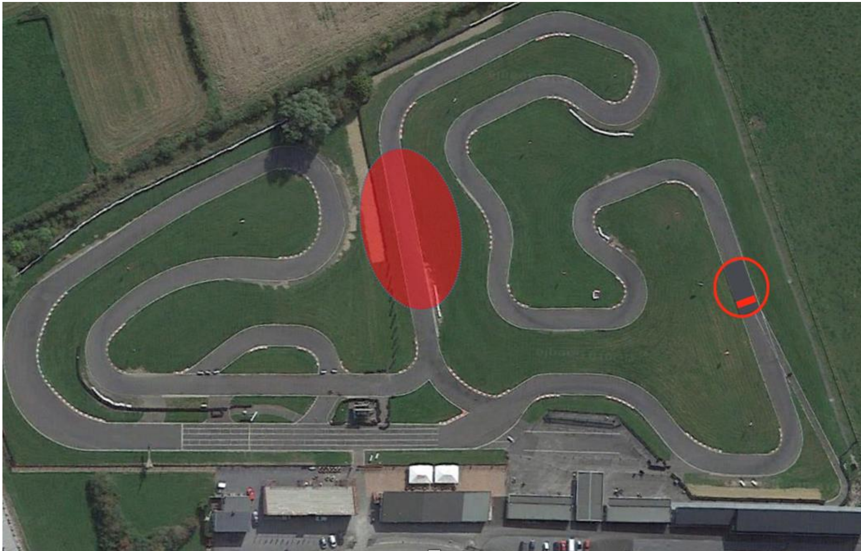
Figure 2. Top view Mariembourg: Warming up lap, formation lap and formation line.